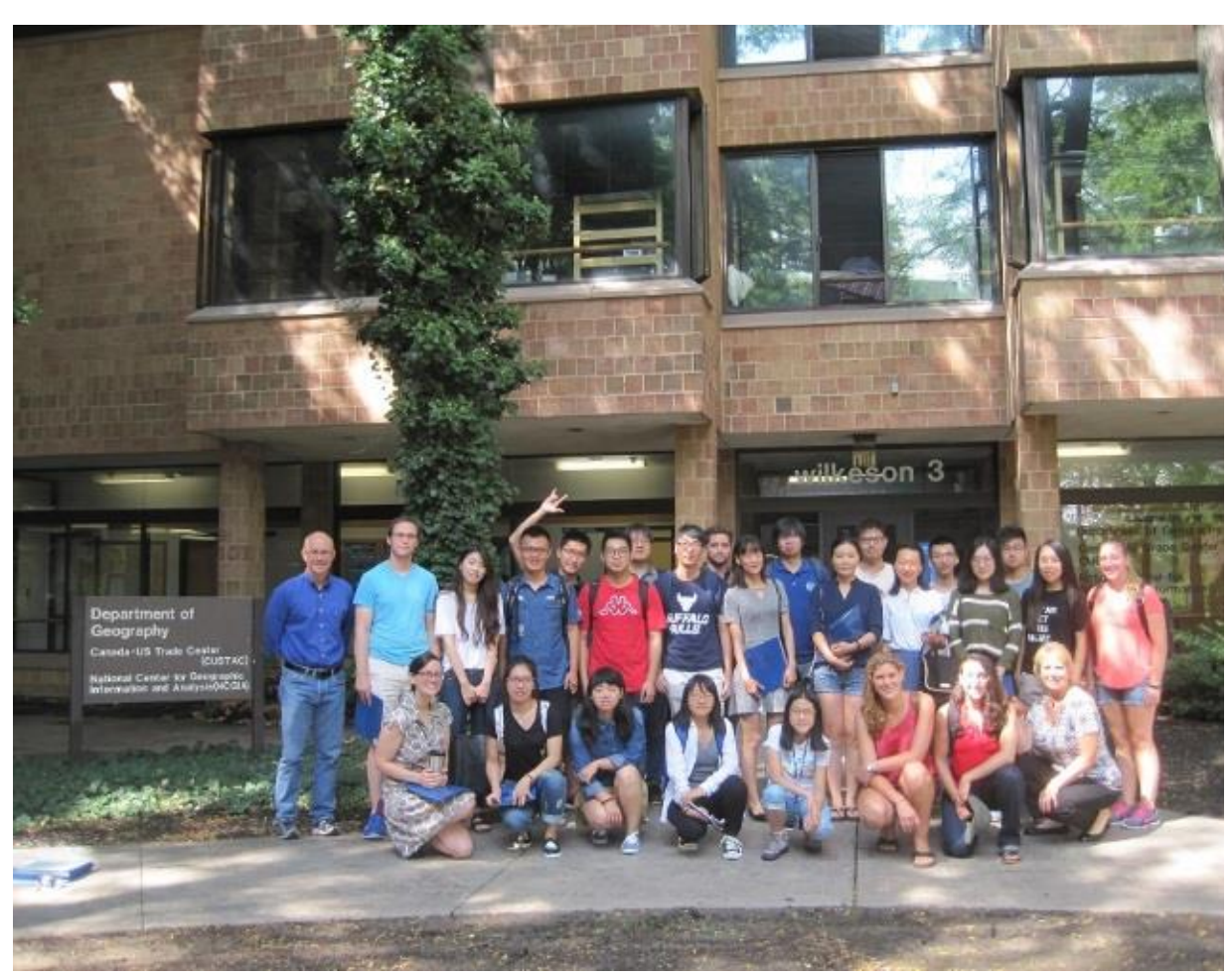
Incoming Fall 2016 graduate students at the reception held on August 26, 2016.