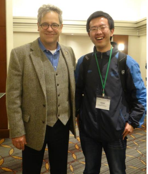
For more AAG photos please visit our Facebook Albums <a href="https://www.facebook.com/geography.ub">https://www.facebook.com/geography.ub</a>